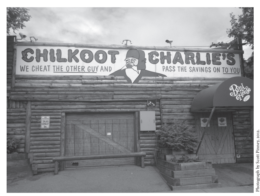
FIGURE 1. Chilkoot Charlie's, Anchorage, Alaska.

powerful federal government and absolute power to start wars. This is a concern now that Donald Trump has gotten elected in 2016, but should have also been a concern had Hillary Clinton won.